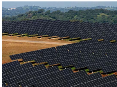
Similar panels will be used at the local solar energy farm

Pod Generating Group is working with Development SSM and City staff to build Canada's largest solar energy farm in Sault Ste. Marie. The project is a $360-million investment. When complete, the site will produce 60 megawatts of renewable electricity, enough to power around 21,000 homes.